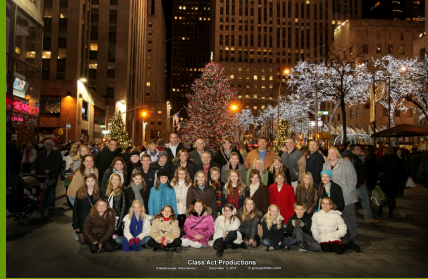
Class Act Productions posing for a picture at Rockefeller Plaza.