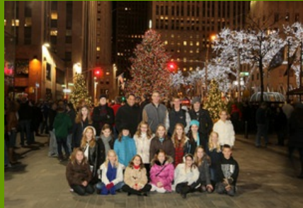
Another picture of Class Act Productions posing in front of Rockefeller Plaza.

Want to see your music ensemble in our newsletter? Send your photos to: