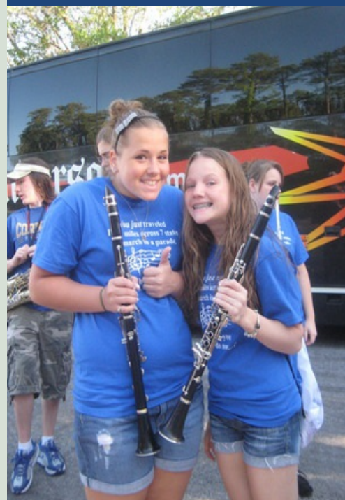
A couple of Cornell High School clarinetists posing for a picture.

The Cornell High School Marching Band performing on Main Street USA at the Magic Kingdom®.