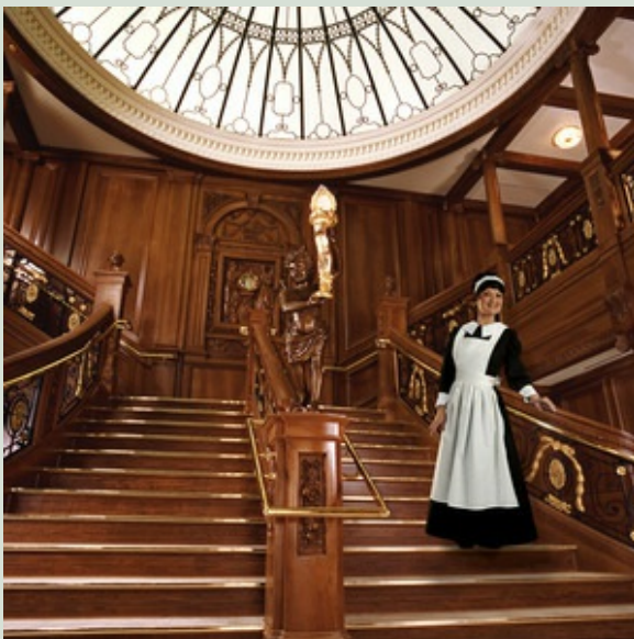
Titanic Grand Staircase - Pigeon Forge, TN

Titanic Museum Attractions in Pigeon Forge, TN and Branson, MO honor and respect the 2,208 passengers and crew members who were onboard the RMS Titanic simply by sharing their stories and keeping their memories alive. This coming year (2012) will be particularly special at the Titanic Museum Attractions as they will pay homage to the lost passengers and crew members 100 years after the Titanic struck an iceberg that fateful night.