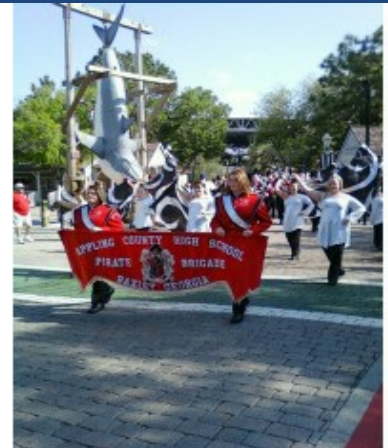
The Appling County High School Marching Band performing at Universal Studios® Florida.