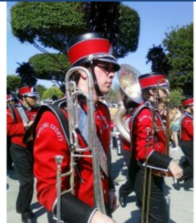
Appling County Marching Band trombone section marching at Universal Studios® Florida..