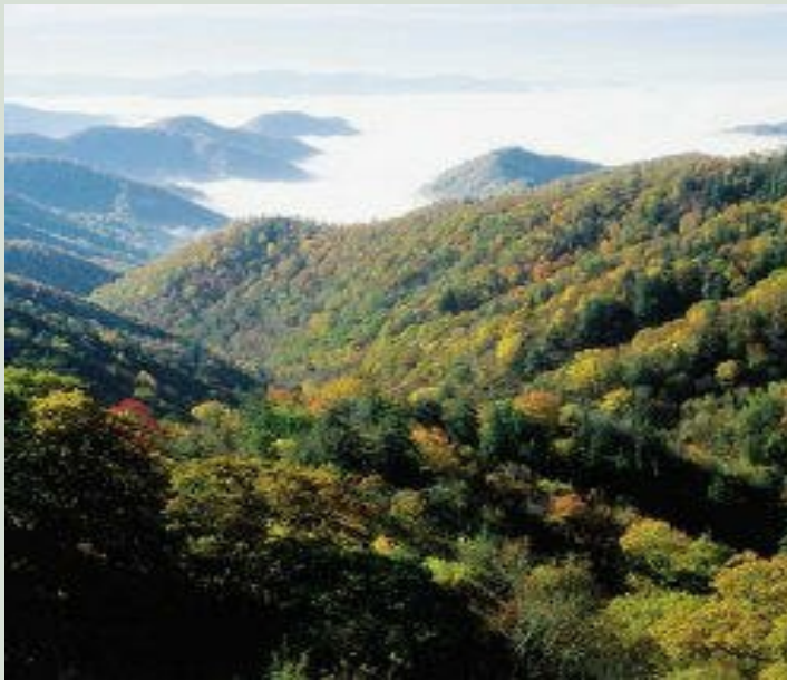
The Great Smoky Mountains

Tucked away in the Great Smoky Mountains of Tennessee, the Pigeon Forge/Gatlinburg destination is filled with fun, excitement and beauty. With a multitude of outstanding attractions, entertaining dinner shows, an award-winning theme park, eclectic museums, southern style dining, tons of shopping and nature trails in the Great Smoky Mountains National Park, your student group will always have something to do. And, no matter where you stay in this destination, great views will abound. The natural beauty and breathtaking scenery of the Great Smoky Mountains, coupled with the excitement of the area itself, make this the perfect student tour destination to visit.