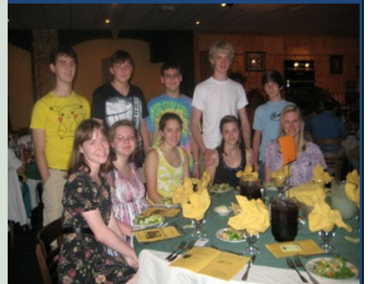
A few of the Stuarts Draft High School students posing for a picture while dining at Sleuth's Mystery Dinner Show.