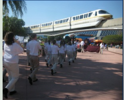
The Stuarts Draft High School Marching Band performing at Epcot.