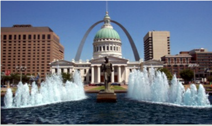
Historic Old Courthouse with the Arch in the background

Being the birthplace of the blues, St. Louis is a place where history and imagination come together to create a Midwest destination like no other. From its beginnings as a simple French village founded in 1764, St. Louis has grown into an amazing, exciting and character-filled city, especially for student tours. The magnificent Gateway Arch, opened in 1965 as a memorial to Thomas Jefferson's dream of a continental United States, stands as a world-famous iconic structure and represents the nation's western gateway. Beyond the arch, St. Louis offers student groups an exciting array of unique attractions, historical sites, world-class museums, shopping, delectable dining, fine arts, pro-sports, performance sites and live entertainment. No matter what you're planning to do, see or explore, your group can find it in St. Louis.