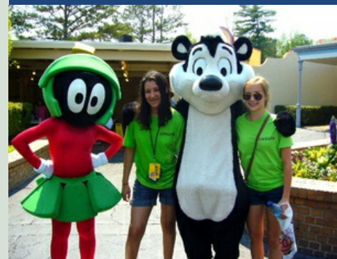
A couple of Oxford Middle School Choir students having a fun time at Six Flags Over Georgia!