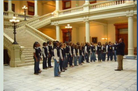
The Oxford Middle School Choir performing at the Georgia State Capitol Building!