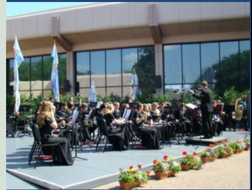
The Gloucester High School Symphonic Band performing at EPCOT!

Want to see your music ensemble in our newsletter? Send your photos to: