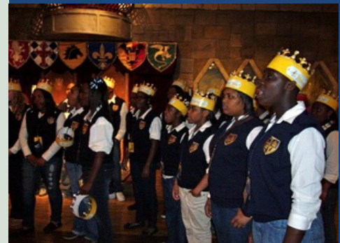
The Oxford Middle School Choir performing at Medieval Times Dinner & Tournament!