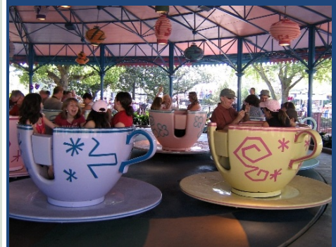
Clintonville Middle School Band students having fun on the Tea Cups at the Magic Kingdom®.