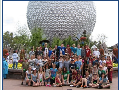
The Clintonville Middle School Band posing for a group photo at the front entrance of EPCOT®.

These fun fotos are of the Clintonville Middle School Band of Clintonville, Wisconsin on their recent trip to Orlando.