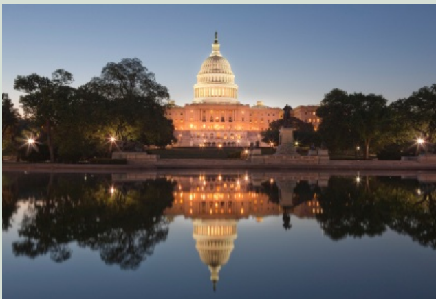
The Capitol Building, Washington DC

Washington DC, the nation's capitol, is not only the best place to