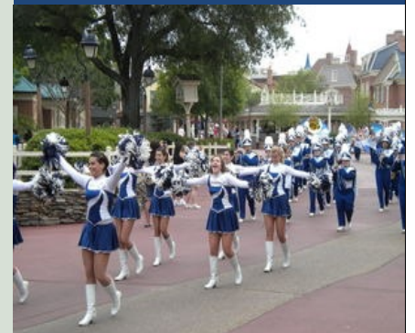
The Sharpsville Blue Devil Marching Band Auxiliary Unit!