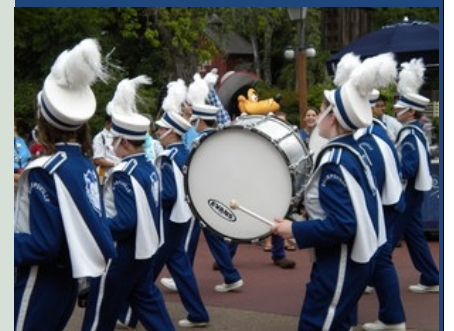
The Sharpsville Blue Devil Percussion Line!