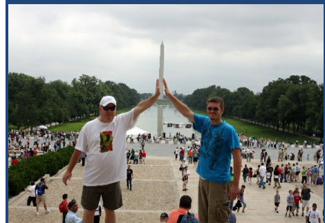
A couple of chaperones not only posing, but making sure the Washington Monument doesn't fall!