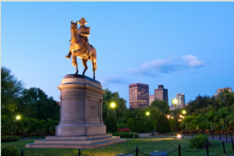
George Washington Monument at the Entrance to Boston Common

Known to many as the birthplace of the United States, Boston is one of America's oldest cities with a fascinating history. Famous for the role it played in the American Revolution, the city is proud