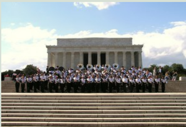
Seminole H.S. Marching Band of Oviedo, FL performing in Washington DC

Let Kaleidoscope Adventures take you and your students to an outstanding performance venue in one of our 40+ destinations throughout the U.S. or Canada. The team at Kaleidoscope Adventures will work with you to meet both your performance and curriculum objectives to provide you and your students a performance opportunity of a lifetime.