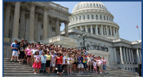
Dekalb County Middle School on the steps of The Capitol.