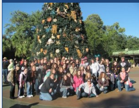
East Paulding H.S. Chorus in front of the Christmas Tree at Animal Kingdom.