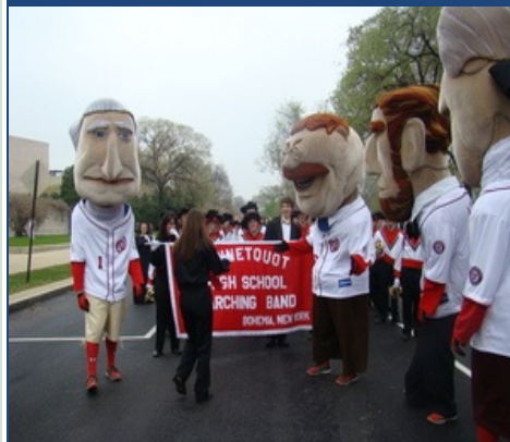
Connetquot H.S. Marching Band with a few Presidential mascots!