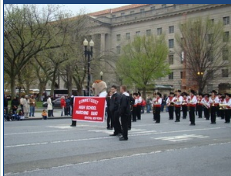
The Connetquot H.S. Marching Band in the parade!