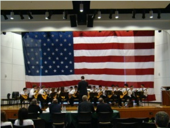
Robinson (Fairfax County, VA) Secondary School Guitar Ensemble

The first annual East Coast GuitarFest, recently held on the campus of Norfolk State University in Norfolk, Virginia on April 15 th and 16 th , was a tremendous success! The East Coast GuitarFest is a festival created to meet the needs of the guitar education community. By bringing this specialized guitar event to directors/teachers and their guitar ensembles throughout the east coast, we are striving to meet the growing needs and popularity of this instrument.