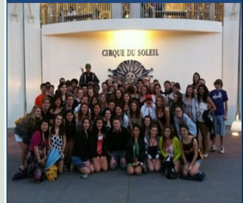
The Chantilly H.S. Show Choir at La Nouba!