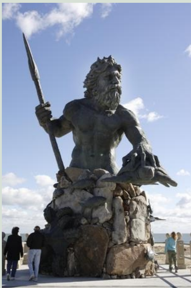
King Neptune Statue on Virginia Beach

While in the Virginia Beach/Norfolk area, your student group can embark on an adventure of a lifetime. Virginia Beach has all of the elements of a classic seaside resort: gorgeous beaches, a lively boardwalk, plenty of restaurants, beachside shopping and exciting attractions sure to appeal to student groups. This destination boasts more than beautiful beaches though. Groups can immerse themselves in the rich naval military history in Norfolk including many military historical sites, first-class museums and the Naval Air Station. Traveling a bit north of