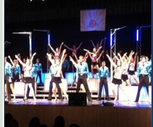
The Chantilly H.S. Show Choir performing at OrlandoFest Music Festival!